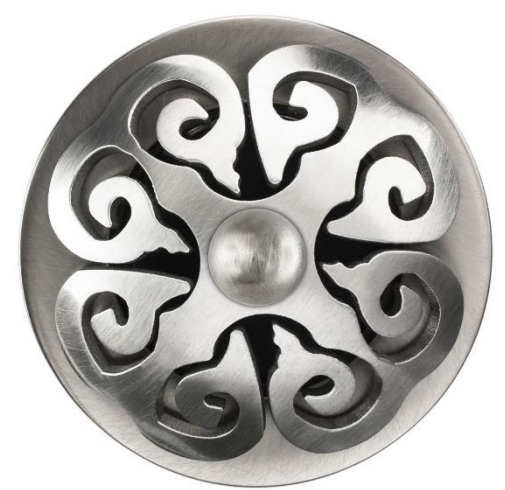
Shown with "SS-SCR01"