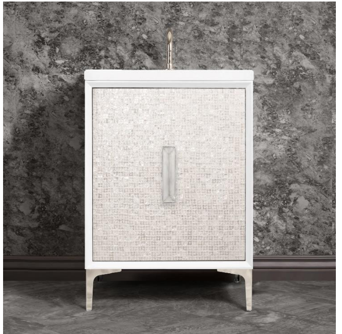
Shown in PN