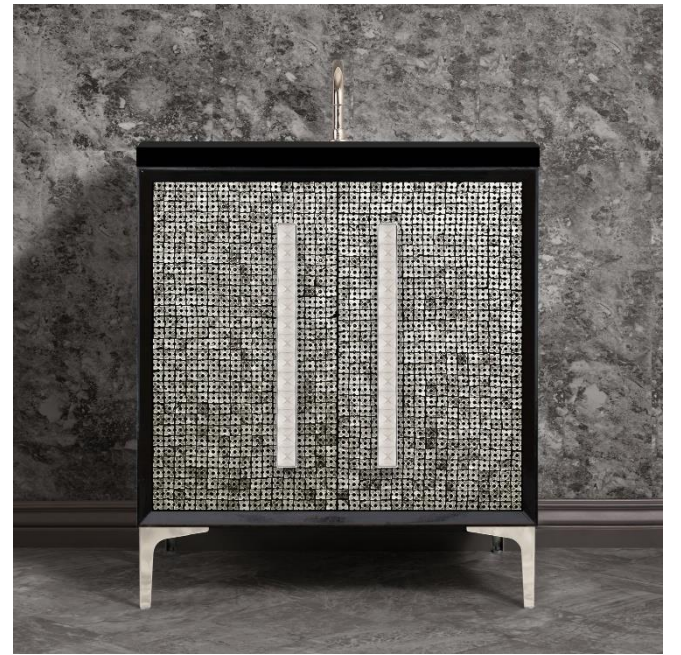
Shown in PN