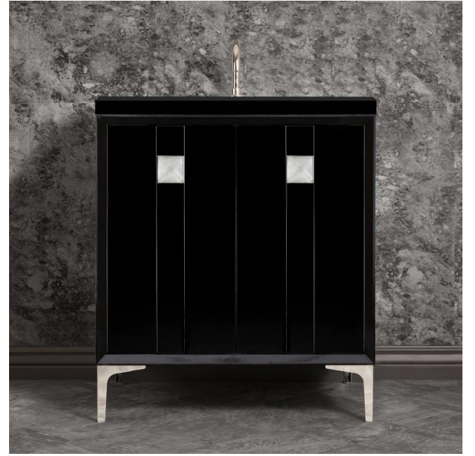
Shown in PN