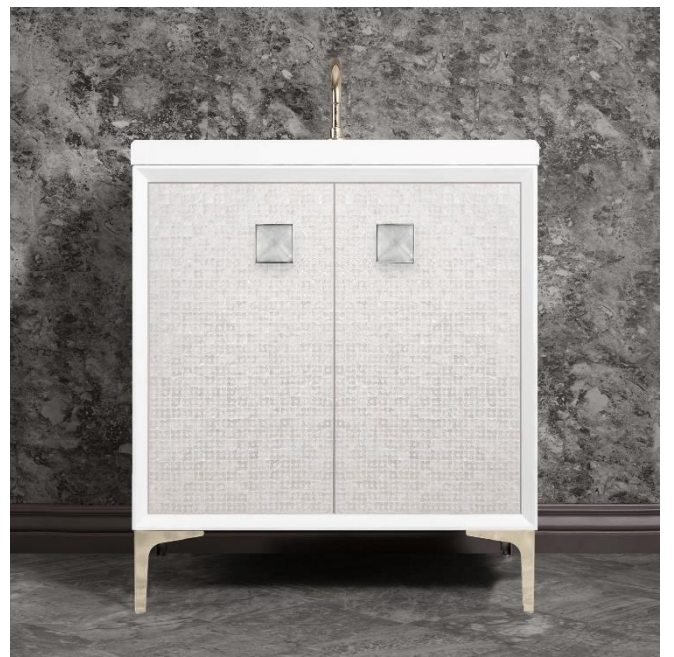
Shown in PN