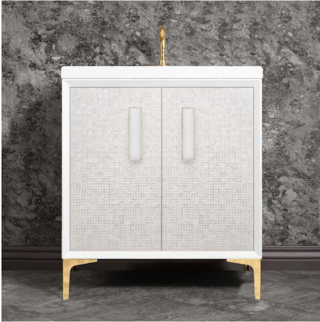
Shown in PB