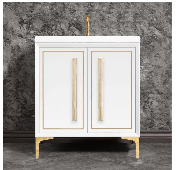
Shown in PB