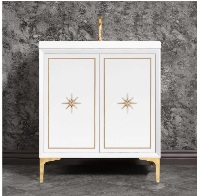
Shown in PB